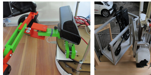
Fig. 2. Rollator-robot-adapter (left). StairWalker including transport platform (right).