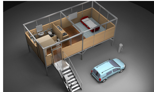
Fig. 1. A fully functional test apartment was built at TUM to simulate and optimize the robot-assisted mobility chain.

A master PC controls the mobile robot, which can also be controlled by the tablet-PC, and is linked to the door opening system, as well as the remote controller of the StairWalker through Arduino, as shown in Fig. 3.